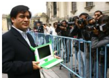
Peru's Education Minister, Jose Antonio Chang, shows off one of the laptops that will soon be available to Peruvian students.

According to Chang, the details over the conditions that are needed to subscribe to MIT's 'One Laptop per Child' program are currently being evaluated by Peruvian officials.